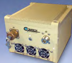
X-Band: 20W Linear