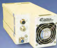
X-Band: 50W Linear