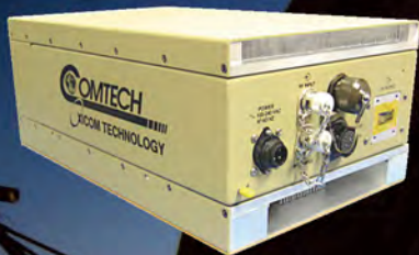
Ku-Band: 100W & 200W Linear X-Band: 100W & 200W Linear