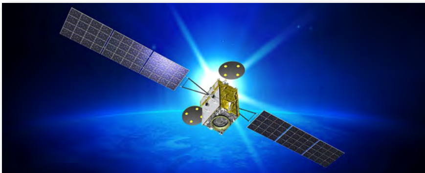
Artist rendition of Yamal satellite 601.

more cost-effectively. Yamal-601 is also equipped with Ka-band payload providing 32 beams covering the most populated regions of Russia. GSS is focused on growth with Yamal-601, the company