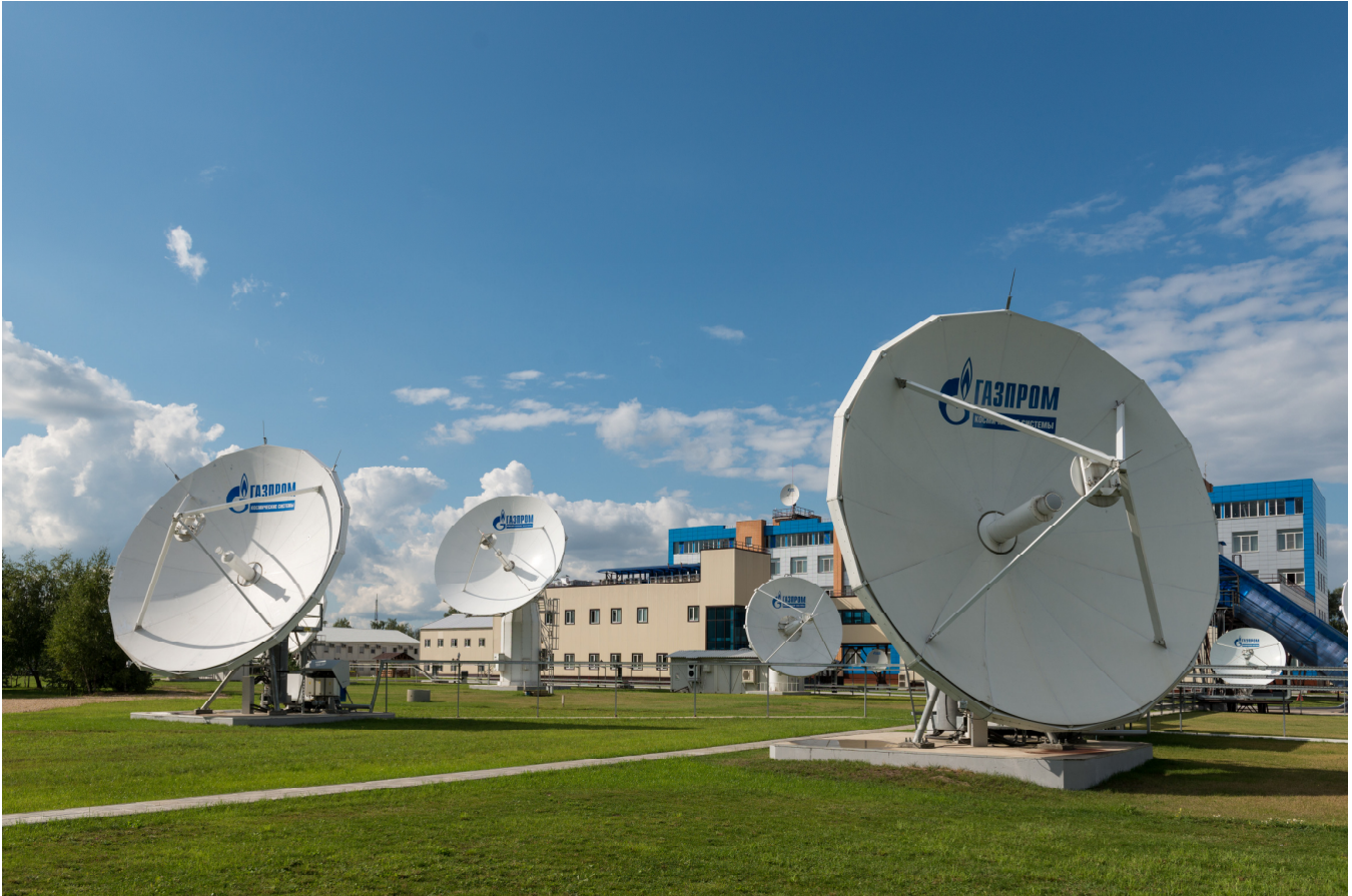
Pictured above is GSS' telecommunication center in Schelkovo near Moscow. On the right is the Yamal satellite mission control center.

was ensured by the increased utilization of the Yamal-300K and Yamal-402 satellites which were launched in 2012. This pushed our company revenues to surpass the key milestone of over US$ 100 million and advanced us three positions in the Top Fixed Satellite Service Operators annual ranking published by Space News .